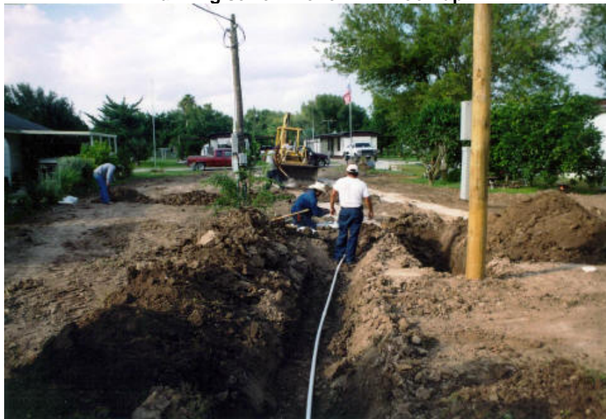
Water line installation.