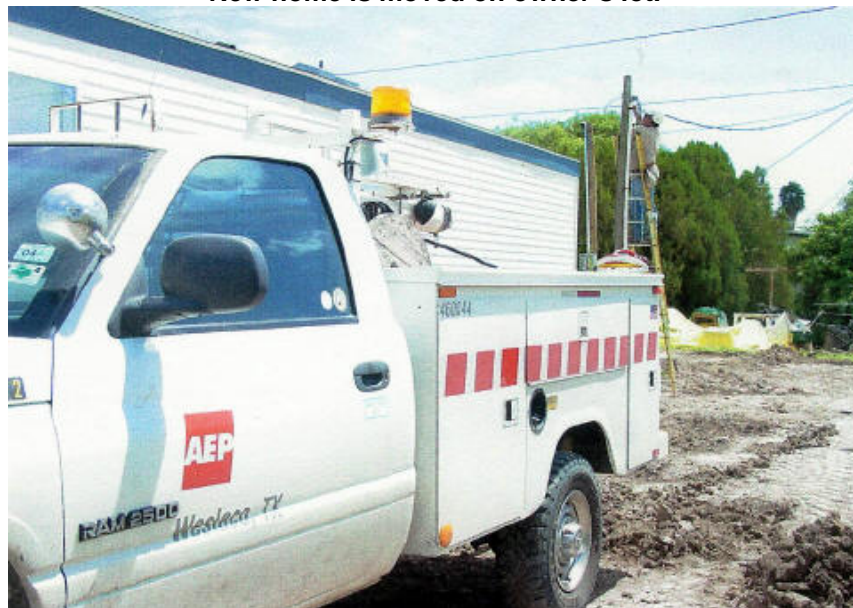
The Electric Company.