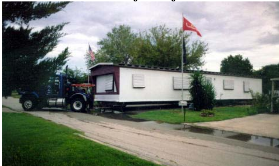
Pulling the old home out.