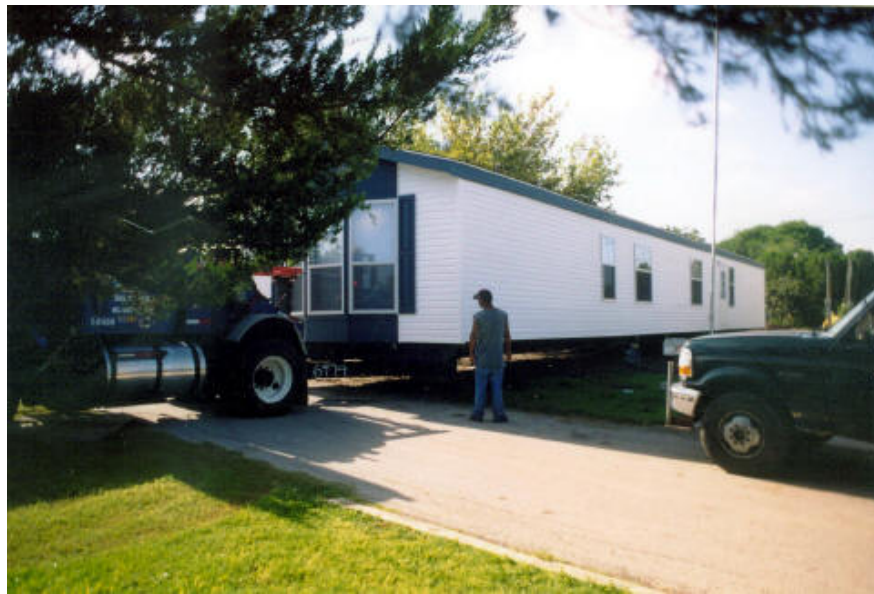
New home is moved on owner's lot.