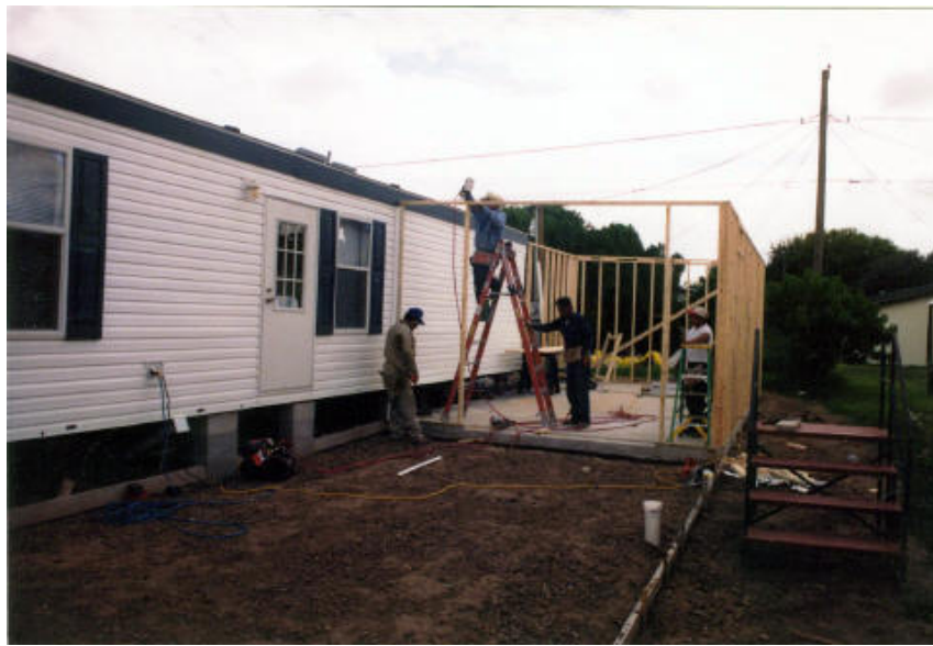
The garage is started.