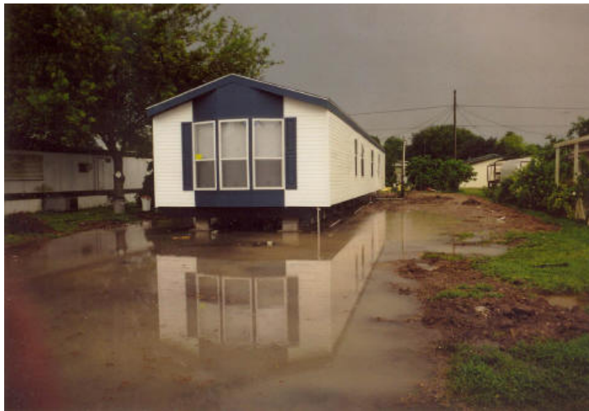
Rain can halt the set-up process.