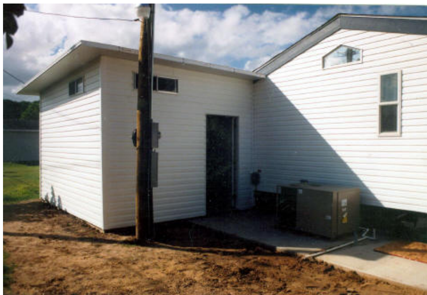
The other side of the garage.