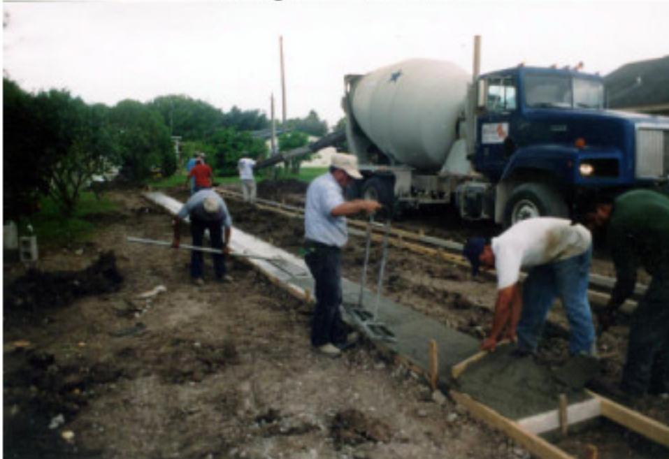
Pouring new concrete runners for new home. As these home owners had designed to have either a driveway, patio, garage, parking area, or sidewalk around and next to the entire home; they selected a foundation of runners to support their home and have the concrete around their home extend back under for their skirting. This saved money.