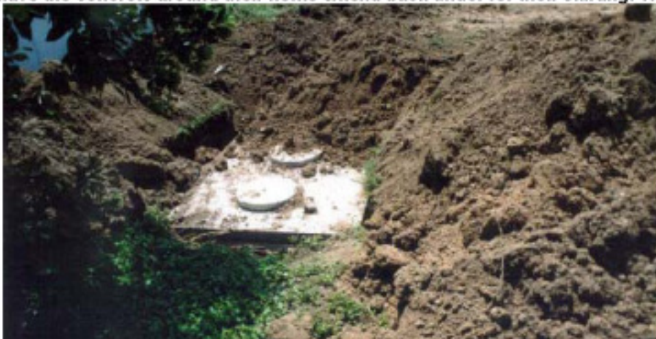
Installation of a new septic system