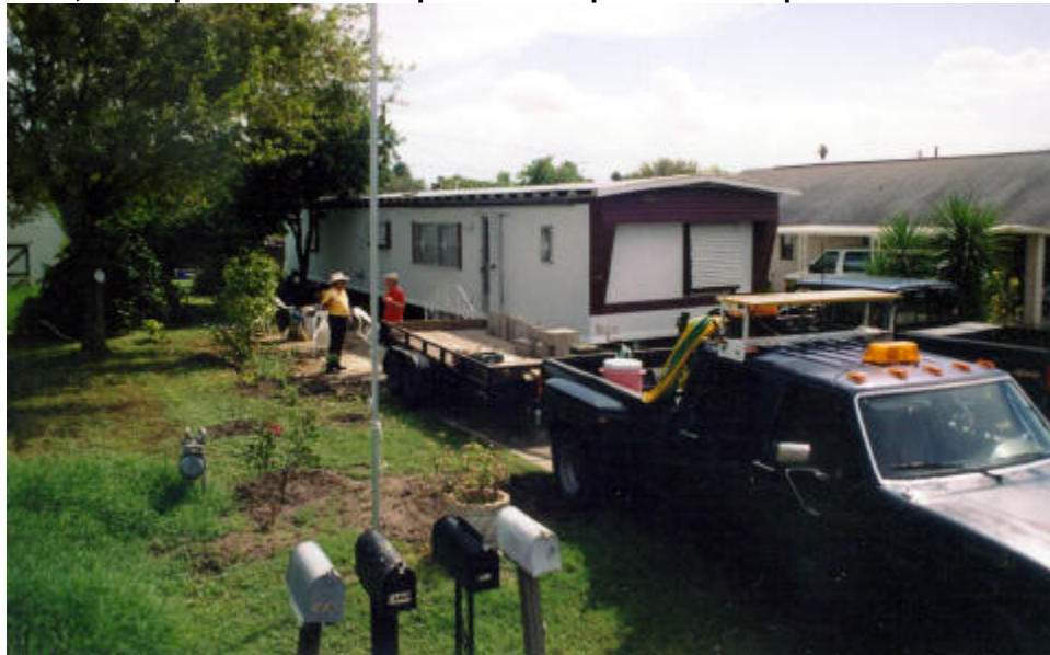
Removal of the awning & skirting of the trade in