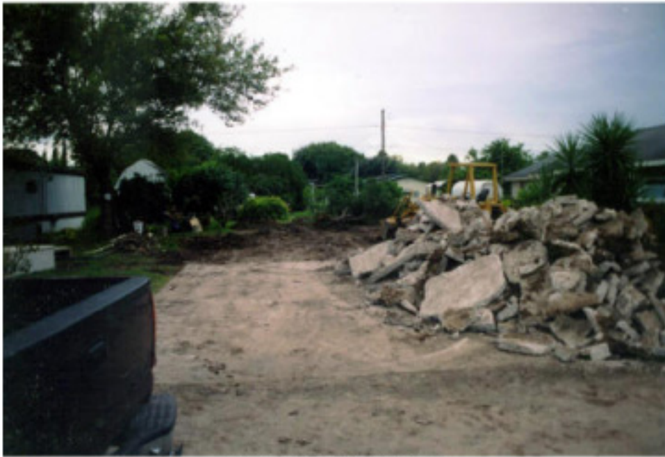
Getting rid of old concrete.