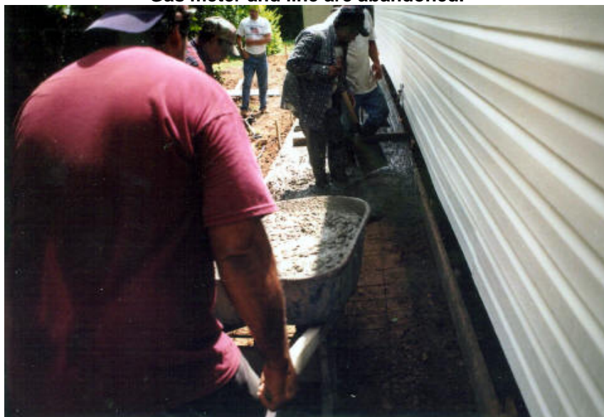
The concrete is brought in for the sidewalk.