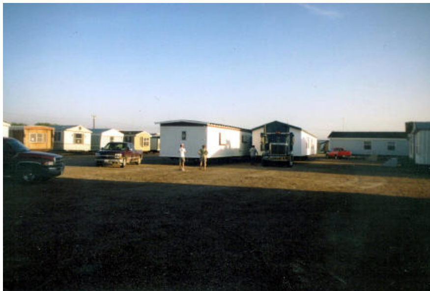
New home arrives to lot and owner's possessions are switched from old home to new home.