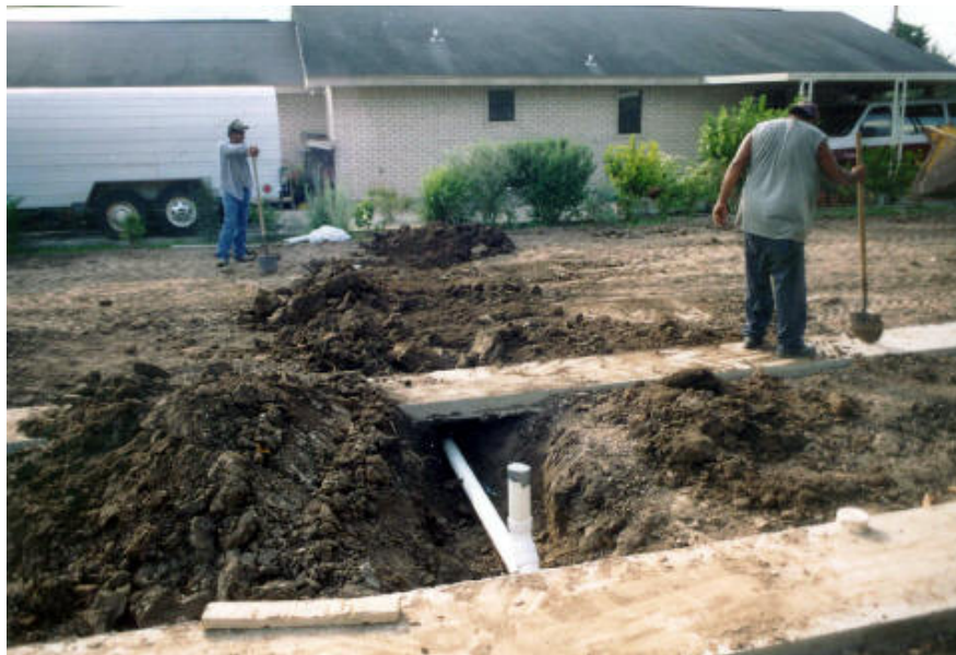
Running sewer line for R.V. hook-up.