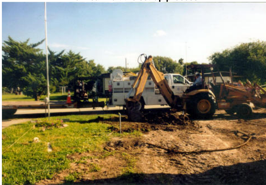
Gas meter and line are abandoned.